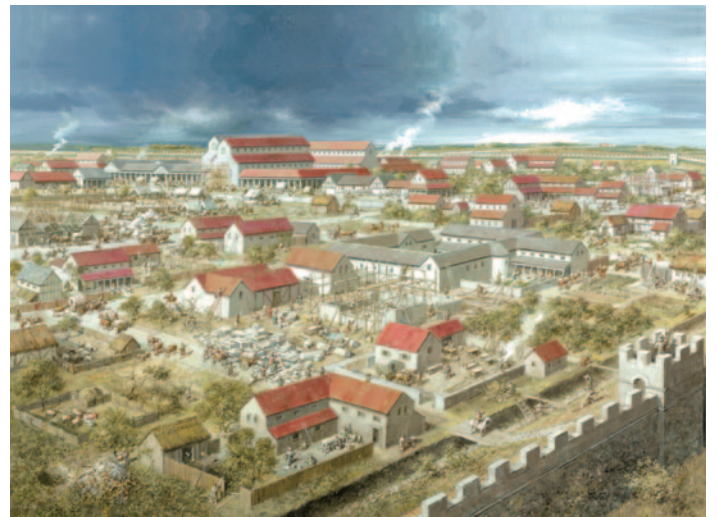
Artist's impression of Roman Leicester in the late 3rd century AD looking south-west.