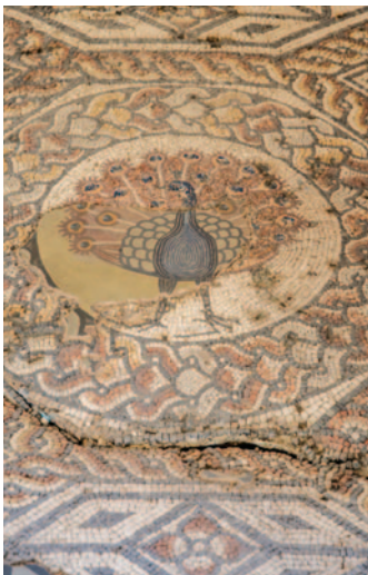
Peacock mosaic, discovered in St. Nicholas Street, 1898.

The main part of the walking trail should take between an hour and 90 minutes to complete, at a moderate pace (stops I-8). It has as an extension of three additional sites (stops 9-11) and a another three a little further afield (stops A-C). We hope that exploring Leicester's busy, multi-cultural streets gives you a flavour of the bustling, diverse Roman city that once thrived here.