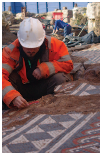
Excavations at the Stibbe Site.